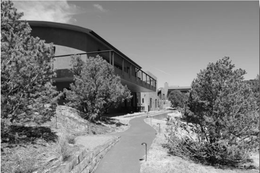
Academy for the Love of Learning Campus (West).