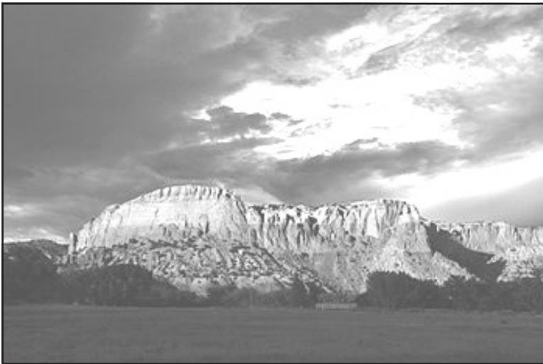
Cliffs at Ghost Ranch. Geologic formations: white Todilto Formation is thin layer at top; Entrada Sandstone is massive white cliff in middle, softer Chinle Formation at base. Lecture 7 (p. 27) and Trip 4 (p. 30) address the Geology of the Ghost Ranch area.