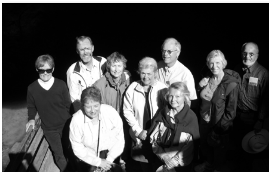
Participants of El Morro-El Malpais RENESAN overnight field trip, September 21-22, 2012. Top photo taken inside the Bandera volcanic crater looking northeast at the crater rim. The Bandera Lava Flow originated from this crater about 10,000 years ago. Bottom photo taken inside an ice cave within a lava tube in the Bandera lava flow. Ice in floor of cave (in lower left) never melts in the summer and the cave temperature never gets above 31° F.